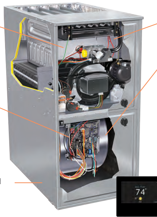
G9 Gas Furnace

Quiet – Solid, pre-painted steel insulated cabinet with tight-fit door latch, isolated blower motor, and soft-mount rubber gaskets on key components contribute to quieter operation.